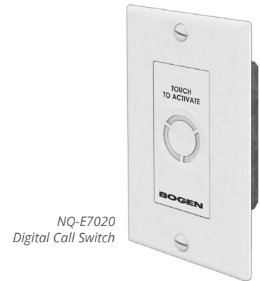
NQ-E7020 Digital Call Switch