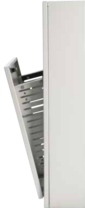
AWR3W (Side View)