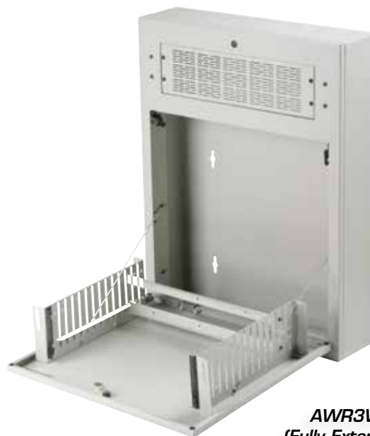
AWR3W (Fully Extended)

©2007 Atlas Sound L.P. All rights reserved. Atlas Sound and Strategy Series are trademarks of Atlas Sound L.P. All other trademarks are the property of their respective owners. AT5002700 RevA 8/07