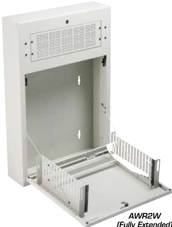
AWR2W (Fully Extended)