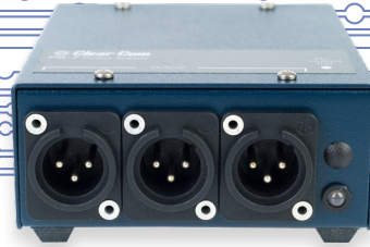
PK-7 Front Panel