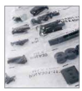
Mounting Hardware Complete set of screen mounting hardware, labeled for ease of use and ready to go.