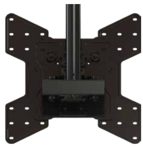
Ceiling mount box and VESA display adapter assembly for 32" to 55"+ displays. Attaches to standard 1.5" threaded extension columns. Continuous tilt of 15° forward with 360° rotation. Makes a secure display installation quick and easy, simply hang the display and turn the pre-assembled securing screw to lock the universal adapter in place. Compatible with all 1.5" NPT threaded pipe.