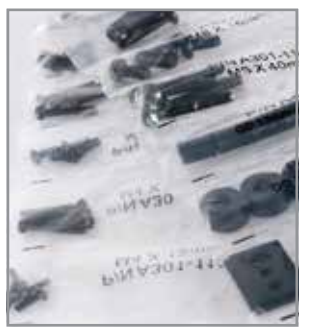
Mounting Hardware Complete set of mounting hardware, labeled for ease of use and ready to go.