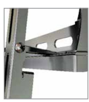
Built-in Kickstand Kickstand holds display away from wall for