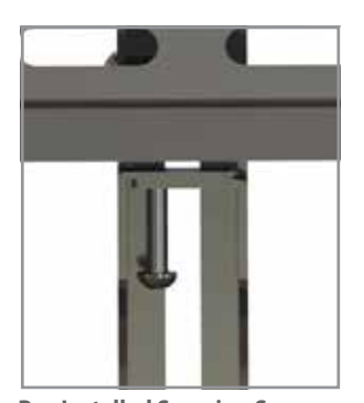
Pre-Installed Securing Screws Easy hook and secure installation and pre-assembled securing screws makes installation fast and easy.