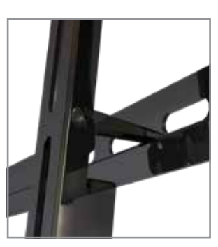
Built-in Kickstand Kickstand holds display away from wall for easy cord installation.