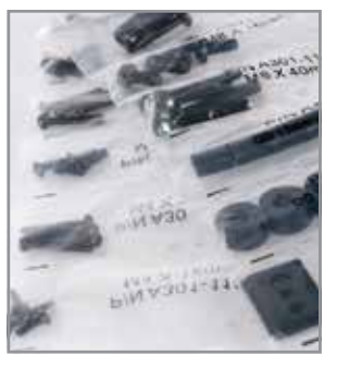
Mounting Hardware Complete set of display mounting hardware, labeled for ease of use and ready to go.