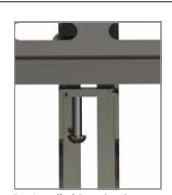
Pre-Installed Securing Screws Easy hook and secure installation and pre-assembled securing screws makes installation fast and easy.