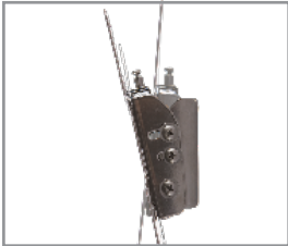
Tilt Pre-tensioned tilt mechanism allows 15° forward and 5° backward tilt for optimal viewing angles.