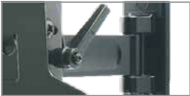
Pivoting Arm 2 pivot joints for variable viewing angles.