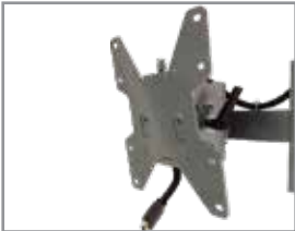
Cord Management Integrated cord management for clutter- free installation.

VESA Compatible Fits VESA hole patterns 75x75mm and 100x100mm 100x200mm and 200x200mm.