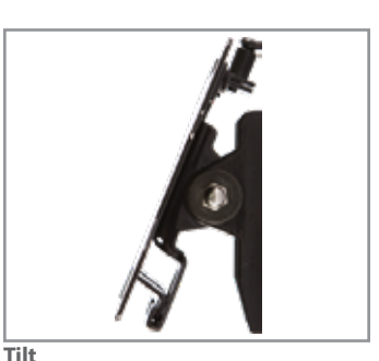
Pre-tensioned tilt mechanism allows for 15° forward and 50 backward tilt for optimal viewing angles.