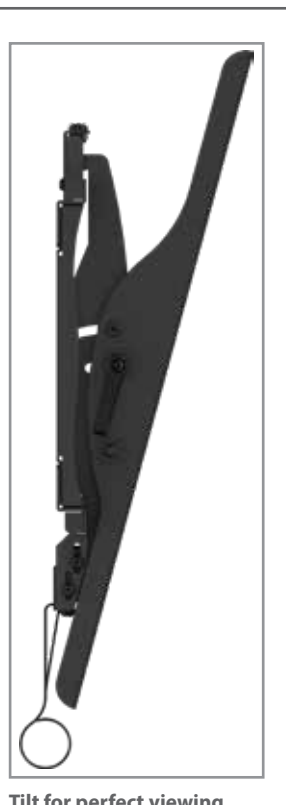
Tilt for perfect viewing Pre-tensioned tilt mechanism allows for smooth tilt adjustment of 15° forward