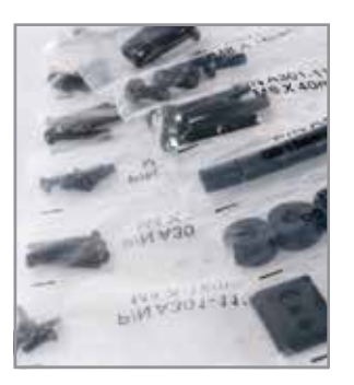
Mounting Hardware Complete set of mounting hardware, labeled for ease of use and ready to go.