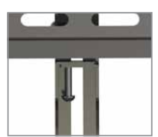
Pre-Installed Securing Screws Easy hook and secure installation and pre assembled\ securing\ screw\ makes\ installation fast and easy.