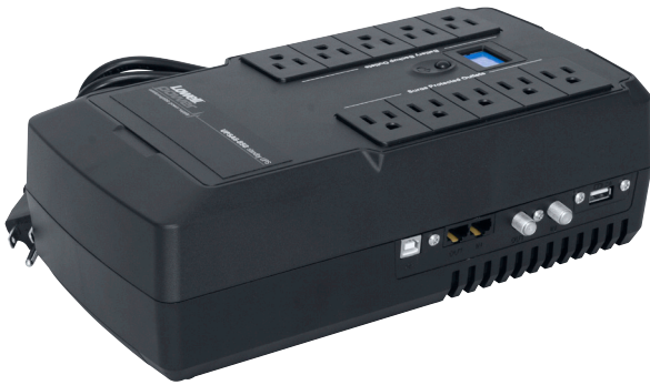
Chassis (6.2 x 12 x 3.7 in.) weighs 6.4 lbs.