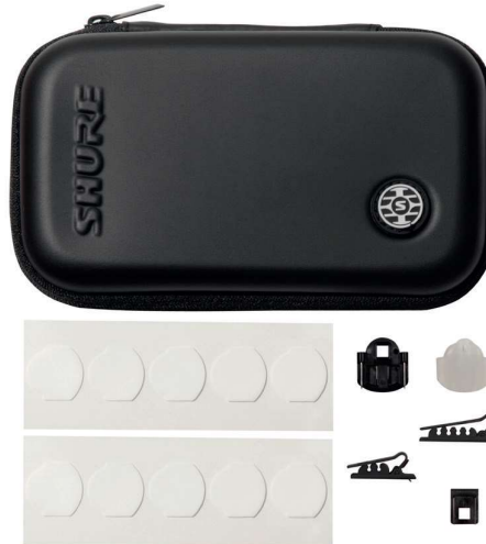
Included Accessories Shown