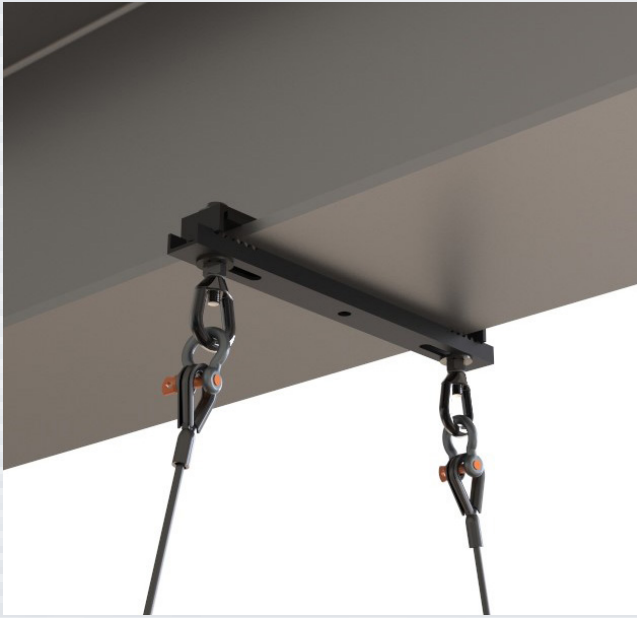
Dual Off-Set Suspensions