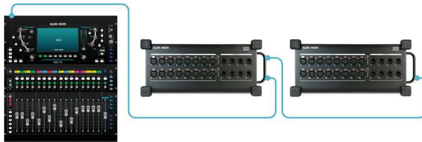
SQ + 2 x DX168 32 remote inputs + 16 remote outputs