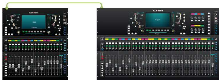
SQ + SQ 128 channels each way