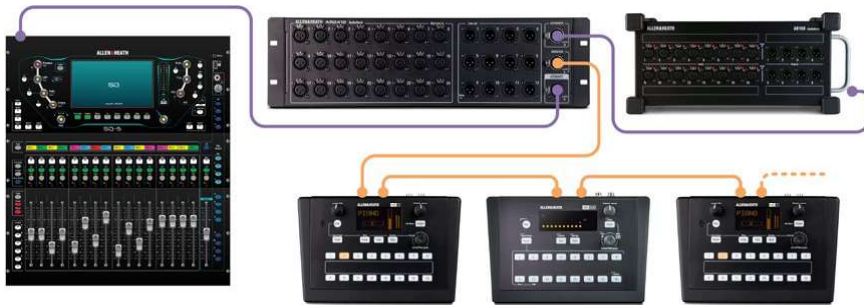
SQ + AR2412 + AB168 + ME system 40 remote inputs + 20 remote outputs + ME system