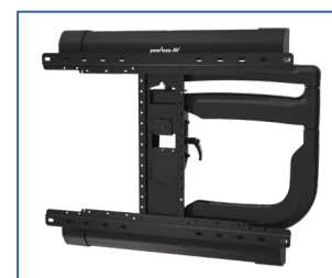
Retracts to hold display 3.0" (76mm) from the wall