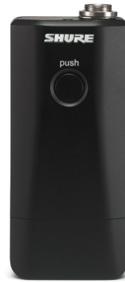
MXW1 Bodypack Transmitter