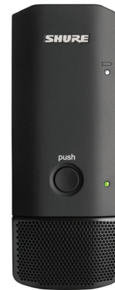
MXW6 Boundary Transmitter