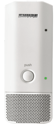
MXW6W Boundary Transmitter