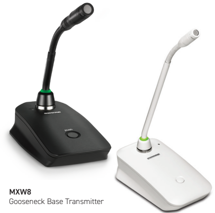
MXW8 Gooseneck Base Transmitter