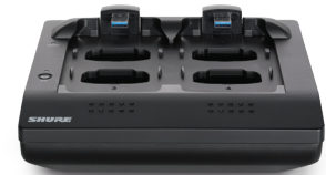
MXWNCS4 Networked Charging Station