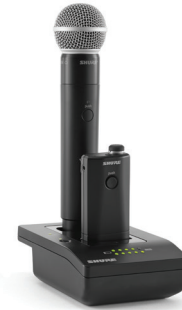
MXWNCS2 Networked Charging Station shown with MXW2/SM58 and MXW6