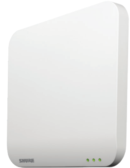
MXWAPT Access Point Transceiver