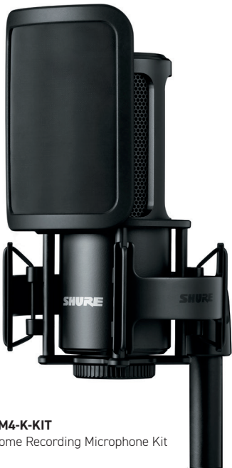
SM4-K-KIT Home Recording Microphone Kit