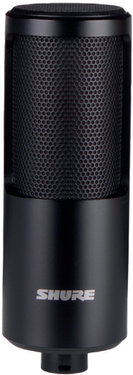
SM4-K Home Recording Microphone